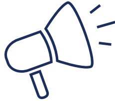
Marketing & Visibility